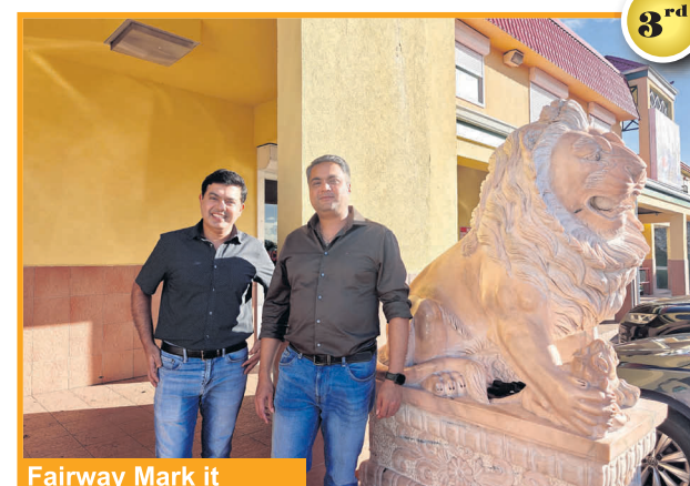
Fairway Mark it

Congratulations to Carrefour Market on being voted Best Supermarket, a well-deserved honour year after year.